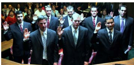
The new lawyers take their oaths

of the Thirteenth Court of Appeals. Fol-